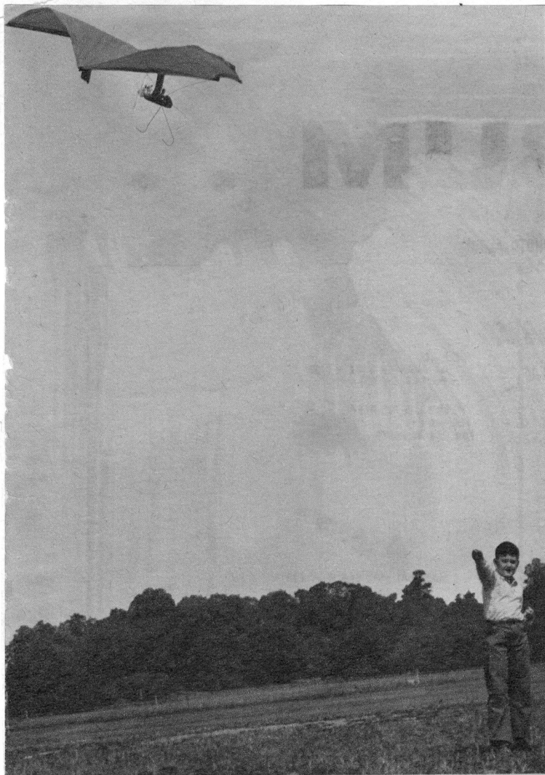
TETHERED TOY swoops and glides at the end of its control line. Long after it runs out of fuel Wing Thing keeps on flying.